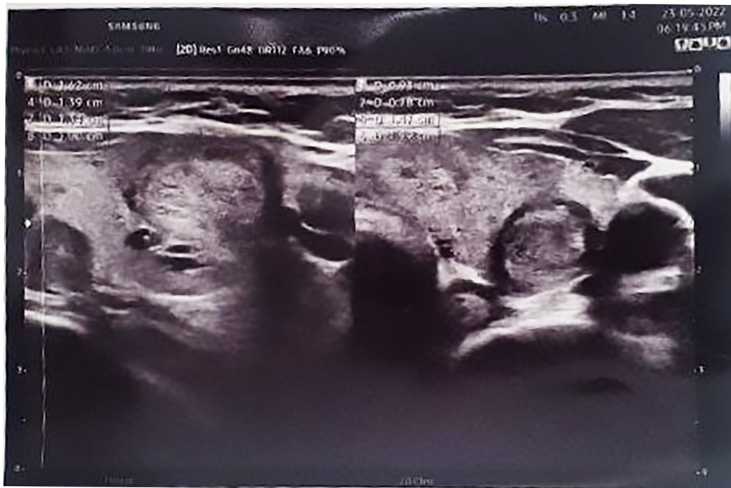
Figure 1. Ultrasound image illustrating a multinodular goiter with mildly suspicious, bilateral homogeneous echo texture nodules measuring 4 mm within the right thyroid gland. The left thyroid gland exhibited a non-suspicious (TR2) nodule measuring 13x9x8 mm and a mildly suspicious (TR3) nodule measuring 10x9x7 mm. Below the left lower pole of the thyroid gland, a solid hypoechoic hypovascular nodule of 20x7 mm was observed, which suggested a parathyroid adenoma. No notable cervical lymphadenopathy was observed.