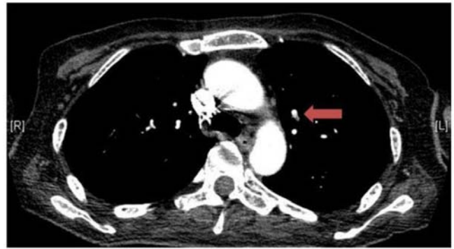
Figure 1. Thoracic computed tomography scan of the patient demonstrating a pulmonary microembolism (red arrow).

Treponema pallidum were negative. The autoimmune panel revealed positive results for antinuclear antibody (ANA) and extractable nuclear antigen (ENA) 1:160. Empiric antibiotic therapy with intravenous ceftriaxone was administered along with anticoagulant treatment based on enoxaparin. Given the patient's origin, it was deemed appropriate to investigate the persistence of malaria. A rapid diagnostic test for malaria (Bioline™ Malaria Ag P.f., Abbott Pharmaceutical Co. Ltd.) yielded positive results for pan-malarial aldolase antigen and P. falciparum histidine-rich protein 2. Subsequently, microscopical examinations were performed. The microscopical assay required a 2.5% Giemsa stain (Kaltex S.r.l.) for the thick film, while the thin film was performed using a 10% Giemsa stain (Kaltex S.r.l.). Buffered water (pH 7.2–7.3) was used to remove unnecessary stain drops after the first coloration steps. Both the Giemsa stain and the buffered water were stored at 25°C before their application within the diagnostic protocol. The microscopic examination of the thick film confirmed the presence of a Plasmodium genus parasite with a parasitemia of 4.0 asexual parasites/ \mu\text{l} . Specifically, a total number of 200 leukocytes were counted within 200 microscopic fields.